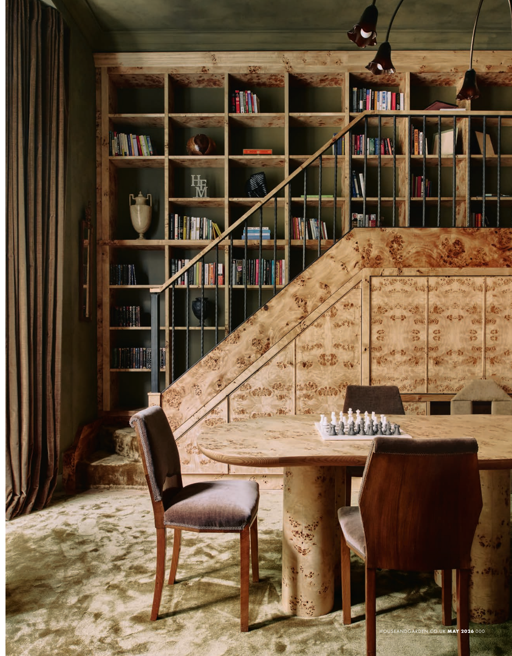
CRAFT ROOM ( above and below left ) On a raised platform, sofas and cushions in earthy Designs of the Time linens serve as extra beds for children's sleepovers. Blackened-wood chairs from a French antique market complement a Galvin Brothers "Titan" table in ebonised oak beside shelves displaying ceramics including Mughal-style red sandstone cooking vessels. SPARE ROOM ( above right ) Walls and shelving in custom colours tone with curtains in a Bruder fabric, bespoke seating and a glass coffee table. BATHROOM Blinds in a textured green Designs of the Time fabric pick up on the hand-painted design on a Drummonds bath. LIBRARY A bespoke burr walnut table, panelling and shelves are teamed with a custom silk carpet, and curtains and chairs in George Spencer Designs velvets